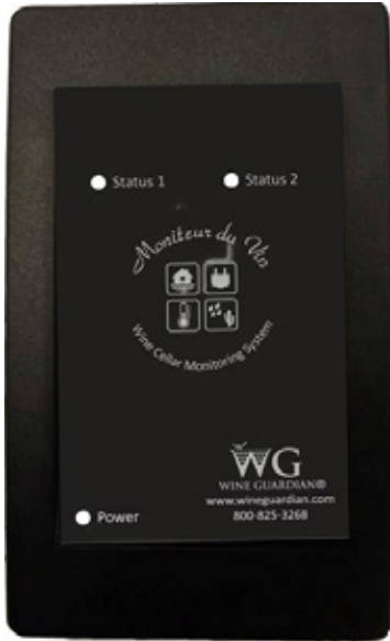
Moniteur Du Vin layout.

Wine is your passion. Preserving it is ours.